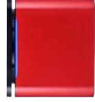
Mic – qPCR cyclers