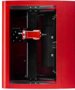
Myra – Liquid handling system

Combine Myra and Mic with our amp/i Cube products Space-saving instruments for fast and safe reaction setup and amplification